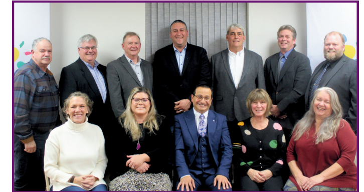
The West Hants Regional Municipality Council was sworn in on November 5. While WHRM is just four years old, incredible progress has been made in our region. This is a direct result of the work of many: Councillors, staff, and YOU, the INSPIRING people of West Hants!