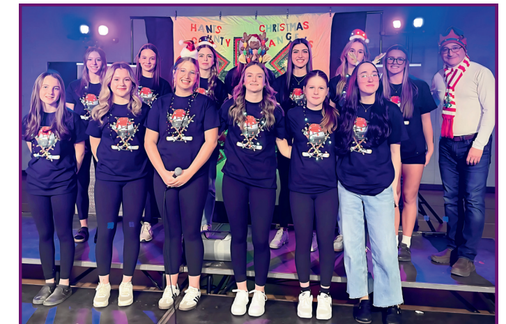
Both the Avon View boys and girls hockey teams made their choir debut during the webathon. The community support was "inspiring"!