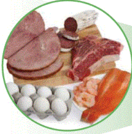
Meat, poultry, seafood, eggs, dairy (including bones)