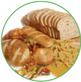
Breads, grains, pasta, cereal