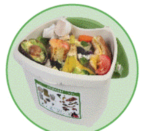
Once kitchen pail is full, empty into the large, green composting bin