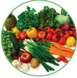
Fruits and vegetables