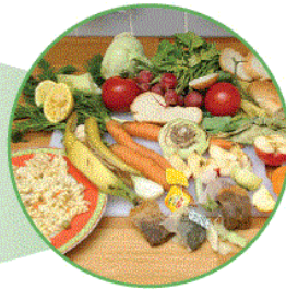
Leftovers, kitchen scraps (including coffee grounds/filters)