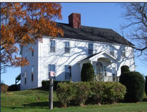
Figure 6: Provincial Heritage Properties

In West Hants, there are four (4) Provincially designated heritage properties (Figure 6).