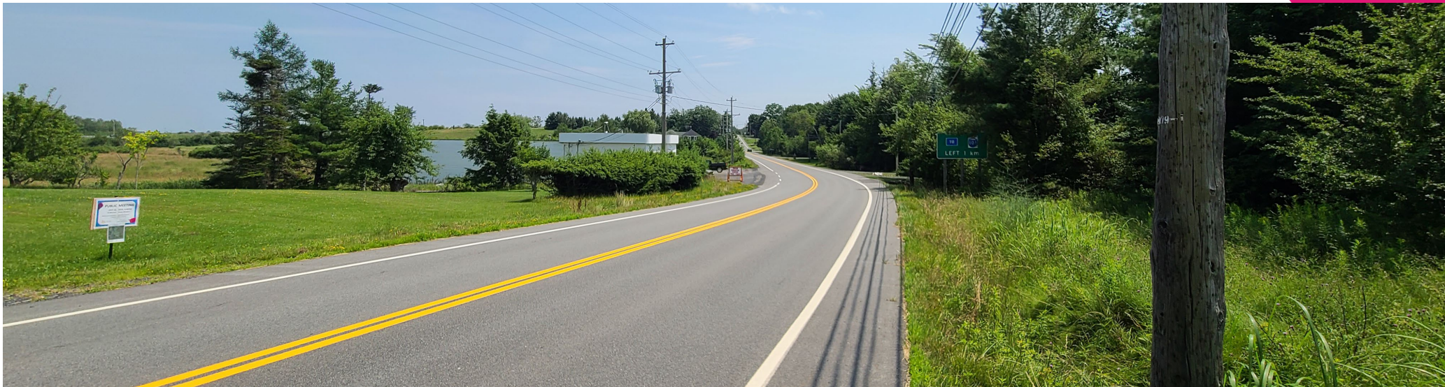
View of Surrounding Area on Highway 1