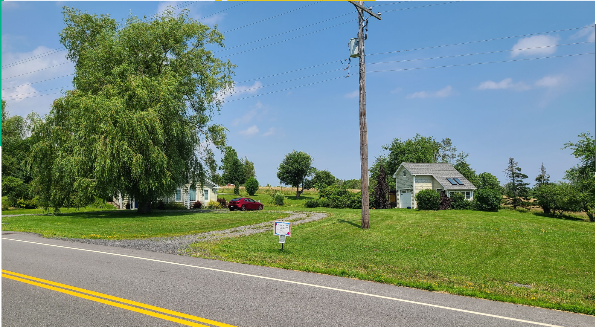
View of Subject Lot from Highway 1